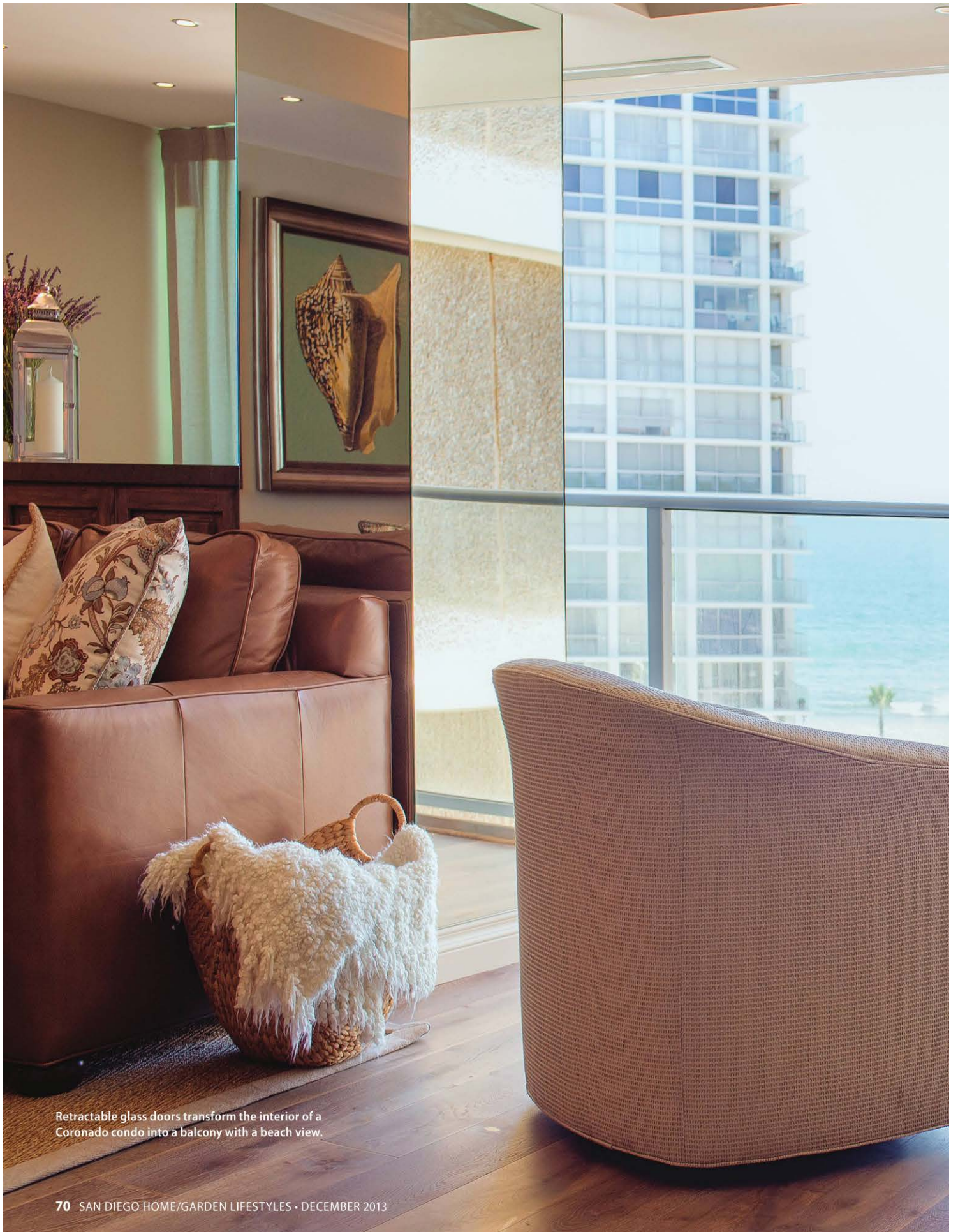
Retractable glass doors transform the interior of a Coronado condo into a balcony with a beach view.